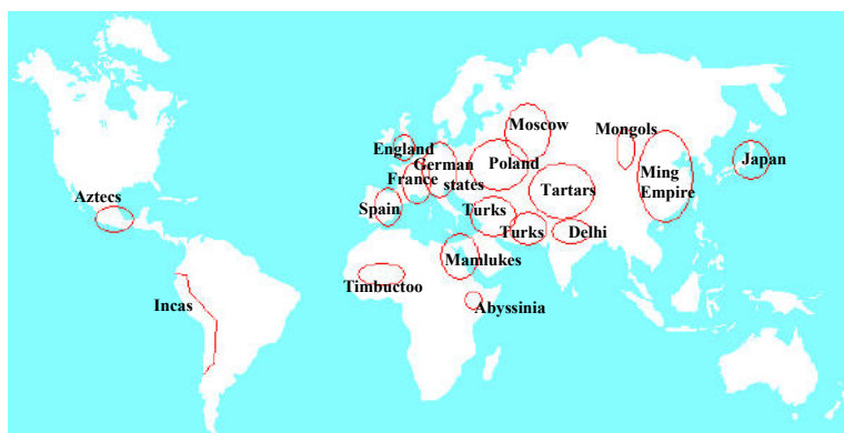
The most important world states in 1492

The majority of Native Americans had no immunity to diseases of Europe, Asia and Africa.. The moment Europeans appeared in South America their diseases spread. The diseases produced similar effects to the Black Death in England in the Middle Ages – millions of Native Americans died in a short period of time. This was one reason why Tawantinsuyu collapsed so quickly in 1532.