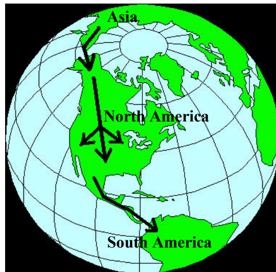
How people moved from Asia to America

Tawantinsuyu was the last of a series of Native American civilizations that existed in the modern country of Peru.